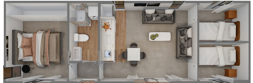
Pukeko | Three Bedroom