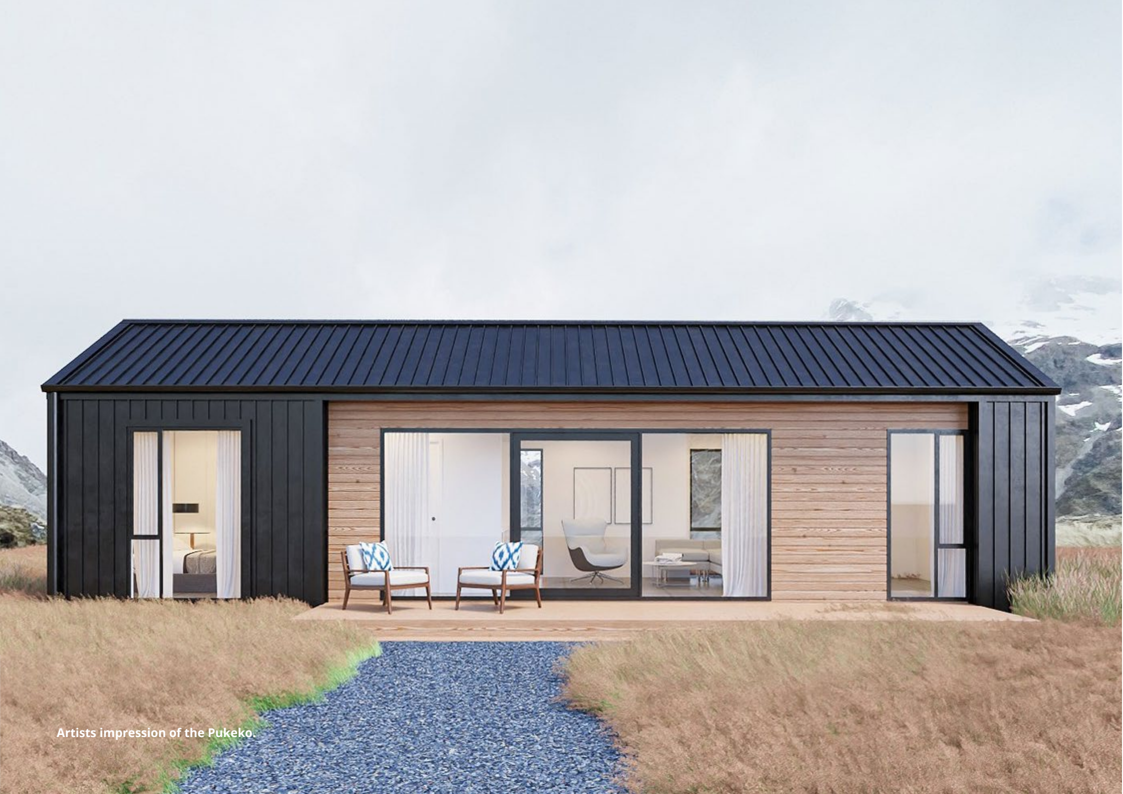
Artists impression of the Pukeko.