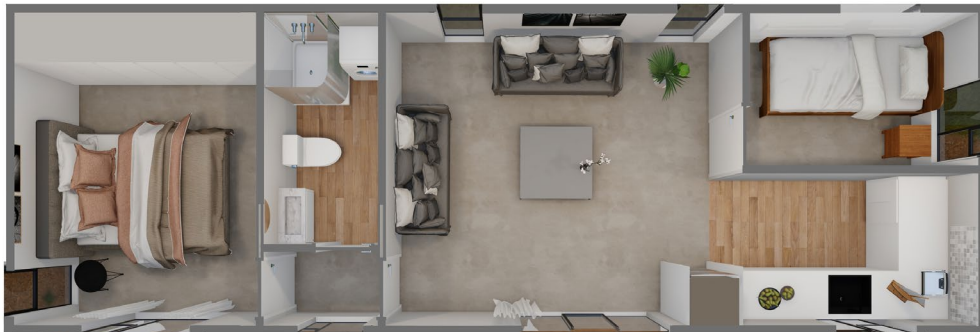
Pukeko | Two Bedroom, Centre Bathroom