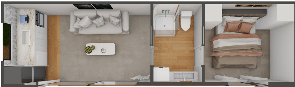
Kaka | Centre Bathroom