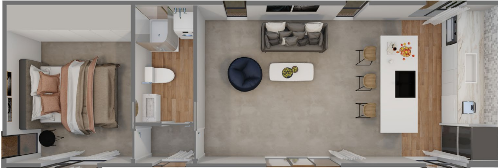
Pukeko | One Bedroom