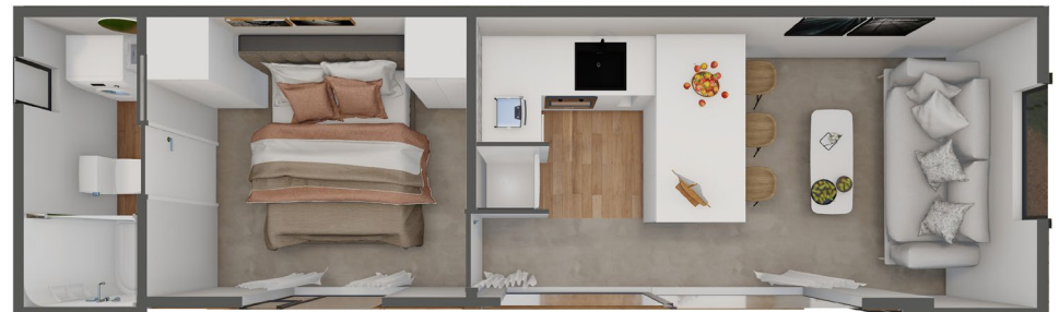
Kaka | Centre Kitchen, End Lounge