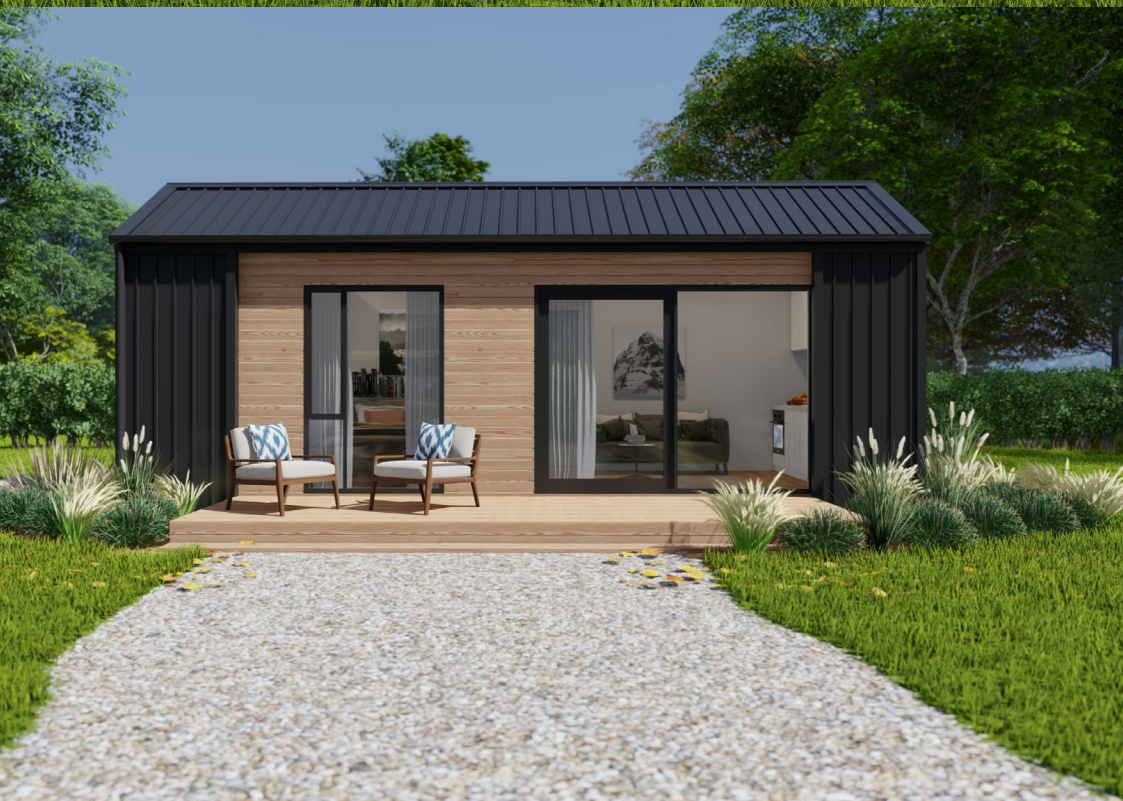
Artists impression of the Kingfisher.