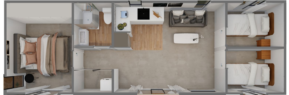
Pukeko | Three Bedroom, Separate Laundry