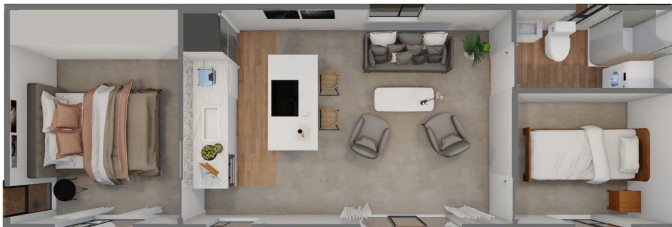
Pukeko | Two Bedroom, Centre Kitchen