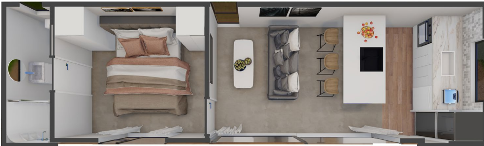
Kaka | End Kitchen Island Bench